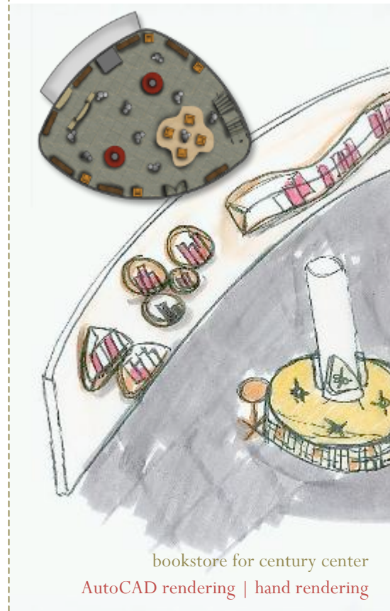
bookstore for century center AutoCAD rendering | hand rendering